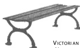
VICTORIAN BACKLESS NUMBER OF RAILS: 6