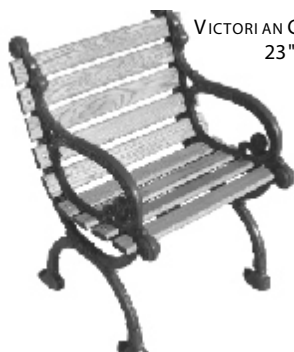
VICTORIAN CHAIR 23"

Transoxide pigments are strategic metals microscopically ground to effect a 90% sun block against damaging ultraviolet