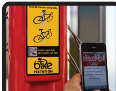
Includes link to online help