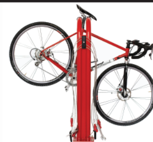
Universal bike mounting - hang by seat or top tube