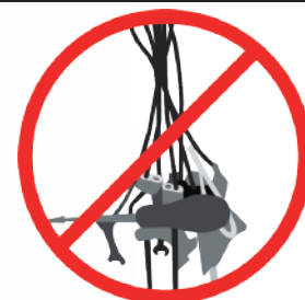
Tool assemblies are spaced to prevent tangling