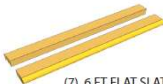
(7) 6 FT FLAT SLATS (2) 6 FT BULLNOSE SLATS