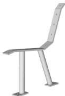
(3) METAL BASES