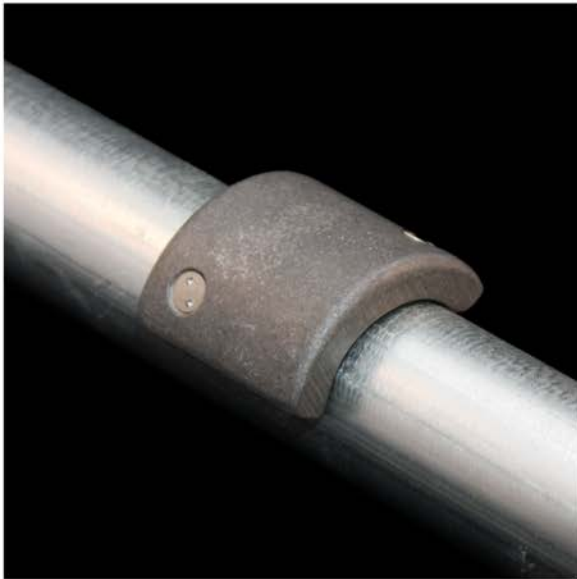
(shown in Cast Aluminum)

Description: The patented cast parts are designed for round, tubular handrails. The part is attached with two stainless steel tamper resistant screws and two-part epoxy.