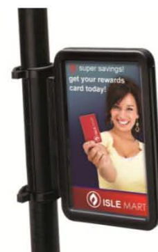
Promote Your Rewards Program

Promote your brand, products, reward programs or other services with the Sqawker. A high-impact promotional sign holder designed to increase sales, profits, customer awareness, and customer loyalty. Changing graphics on the Sqawker is easy so that you can increase the productivity of your employees and increase the effectiveness of your promotional signage. The Sqawker is perfect for promoting your message on the pump island, patio umbrella, and many other applications.